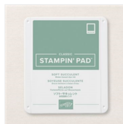
Soft Succulent Classic Stampin' Pad - 155778