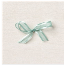
Soft Succulent 3/8\" (1 Cm) Open Weave Ribbon - 155780