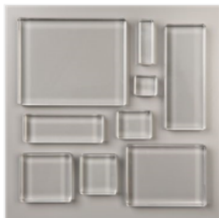
Clear Block Bundle - 118491