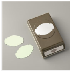
Story Label Punch - 150076