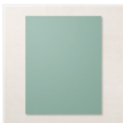
Soft Succulent 8-1/2" X 11" Cardstock - 155776