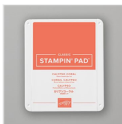
Calyпсо Coral Classic Stampin' Pad - 147101