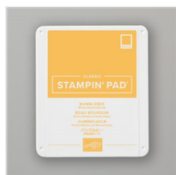
Bumblebee Classic Stampin' Pad - 153116