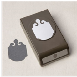
Elegant Tag Punch - 155762

Stampknowhow@verizon.net www.StampKnowHow.com