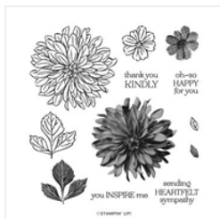
Delicate Dahlias Photopolymer Stamp Set (English) - 156601

Stampknowhow@verizon.net www.StampKnowHow.com