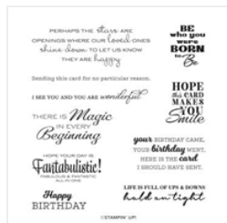
In Your Words Host Cling Stamp Set (English) - 156619