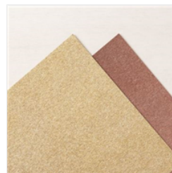
Gold & Rose Gold 6" X 6" (15.2 X 15.2 Cm) Metallic Specialty Paper - 156844