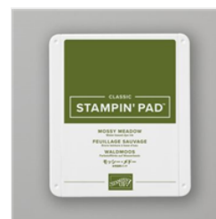
Mossy Meadow Classic Stampin' Pad - 147111