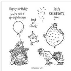
Hey Birthday Chick Cling Stamp Set - 154464