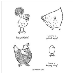
Hey Chick Cling Stamp Set (English) - 158190

Stampknowhow@verizon.net www.StampKnowHow.com