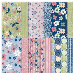
Paper Blooms 12" X 12" (30.5 X 30.5 Cm) Designer Series Paper - 155222