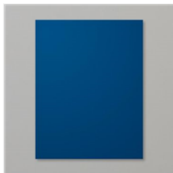
Night Of Navy 8-1/2" X 11" Cardstock - 100867